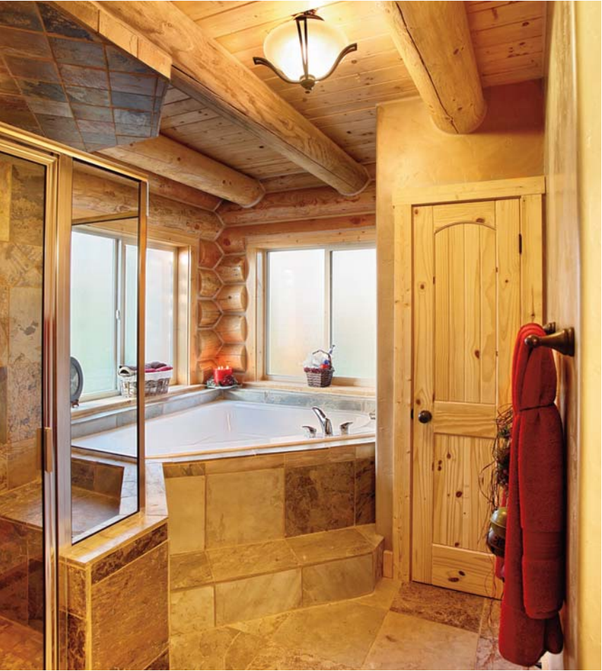
LEFT: SLATE STONE, A CORNER TUB, A PINE WOOD DOOR, AND TWO WINDOWS TO THE WORLD CREATE A WELCOMING ENVIRONMENT IN THE HOME'S MASTER BATHROOM. BELOW: IN ONE OF THE HOME'S SPARE BEDROOMS, A HANDCRAFTED BED AND RUSTIC FINISHES MAKE OCCUPANTS FEEL LIKE THEY ARE TRULY A PART OF THE YELLOWSTONE EXPERIENCE.