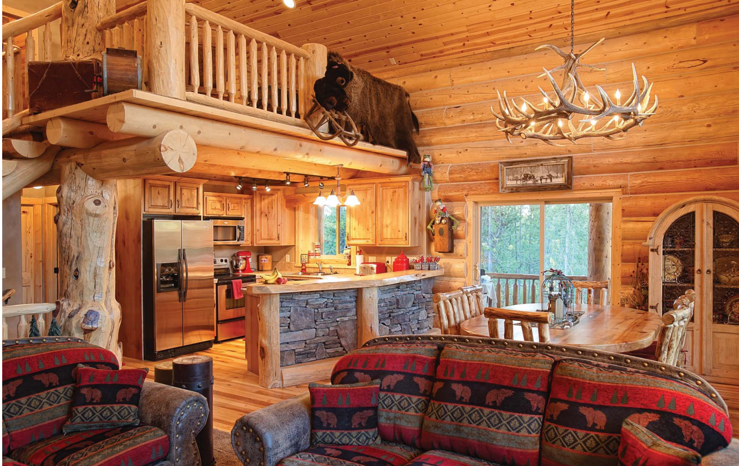
ABOVE: CONSTRUCTED FROM 12-INCH-DIAMETER SWEDISH COPE WALL LOGS, THIS 3,100-SQUARE-FOOT BEAUTY FEATURES AN OPEN FLOOR-PLAN AND A LOFT.